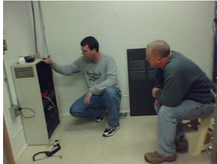
927.5375 repeater turned on for the first time at the W. Republic 400' Alltel tower

donated to the club. Right now, the 224.280 repeater has 9-Watts output and the 444.275 has 20-W output, both in preparation for the install of new amplifiers that will allow the repeaters to cover the area much better. Both repeaters can now also be used without a PL tone if necessary. The new CDMs on the 444.275 have decreased the interference we were receiving as well with their higher quality receiver. In addition, the linking repeater is now programmed so that most ID's will not be re-transmitted out onto the other