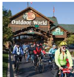
2008 Tour de Bass

For those interested in participating as a SAG or Sweep vehicle, St. Johns is paying mileage at the standard rate for those volunteers! Sweep and sag drivers need to have a truck, jeep or other vehicle that can carry bicycles. A car will work if you have a big trunk or a